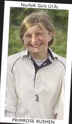
Norfolk Girls U13s