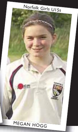
Norfolk Girls U15s