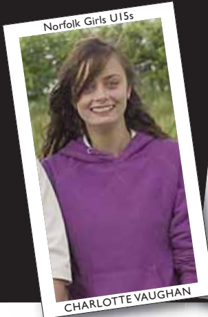
Norfolk Girls U15s