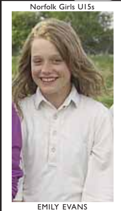
Norfolk Girls U15s